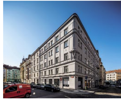
We respect original architecture and history of each place